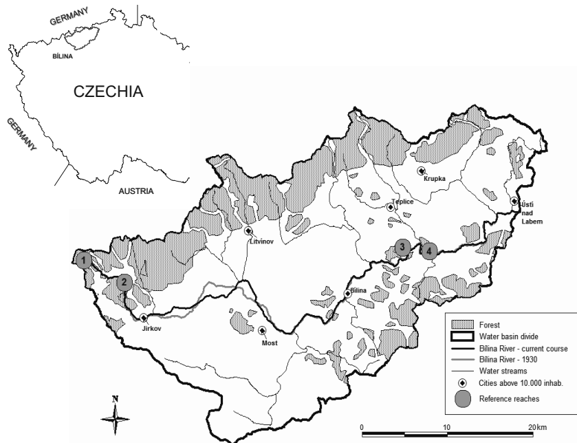
Figure 1. Location of the Bílina River Basin, anthropogenic modification of the main stream and reference reaches for the assessment of hydromorphological quality. Localización de la Cuenca del Río Bílina, modificaciones antropogénicas en el eje principal y tramos de referencia para la evaluación de la calidad hidromorfológica.

Other significant anthropogenic modifications of and interference with the landscape of the Bílina River Basin include the drainage of the largest fluvial lake in Bohemia, Komořanské Lake (5600 ha), which began in the 19 th century. In total, during an 80-year time period, the Bílina River channel has been reduced by nearly 3.9 %. This value is low because it consists of both the reduction as well as the extension of the river length (Fig. 1). Finally, nowadays, more than 20 % of the catchment comprises residential, industrial and mining land uses, while agri-