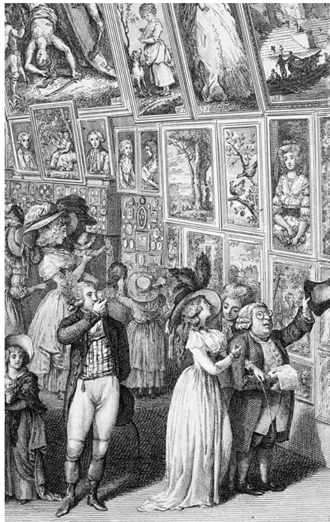
Figure 9. Pietro Antonio Martini after a drawing by Johann Heinrich Ramberg, The Exhibition of the Royal Academy, 1787 , detail.

to be appreciated. From 1760 numerous publications came out explaining the appropriate behaviour the spectator was expected to adopt when faced with art and, in this case, how paintings had to be contemplated and evaluated. One such publication, which received widespread popularity, was specifically aimed at women, who, as can be seen in the engraving, flocked to the exhibition in great numbers. Published in 1767, The Polite Arts, dedicated to the Ladies recommended women not to view paintings too close up, as ignorant people would do, but instead begin from a distance, in order to then approach them gradually, in the manner of the connoisseurs. 44 Observing a painting was not merely a matter of aesthetic judgement, but also a form of social deportment that had to be regulated. The President of the Royal Academy was concerned about the danger involved in the exhibitions, as the noble style it advocated could be jeopardised if artists devoted themselves to pleasing the dubious taste