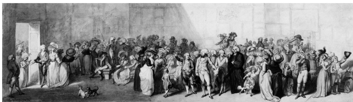
Figure 7. Johann Heinrich Ramberg, Study for the figures of The Exhibition of the Royal Academy, 1787 . Pen, grey and brown ink and wash over pencil, 162 x 510 mm. Copyright The Trustees of The British Museum.

cent zenithal lighting, which, as referred to above, had been a subject of debate for many years, although nothing was done about it until 1789. The information about the architectonic space provided by the two prints reflects, therefore, the greater elegance of the Great Room illuminated from above in contrast with the more planimetric Salon Carré.