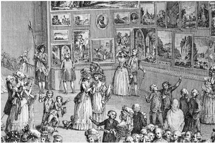
Figure 3. Pietro Antonio Martini, Exposition au Salon du Louvre en 1787 , detail.

16. L'Année Littéraire , September 18, p. 290.