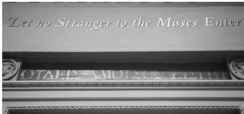
Figure 8. Inscription above the entrance to the Great Room, Somerset House.