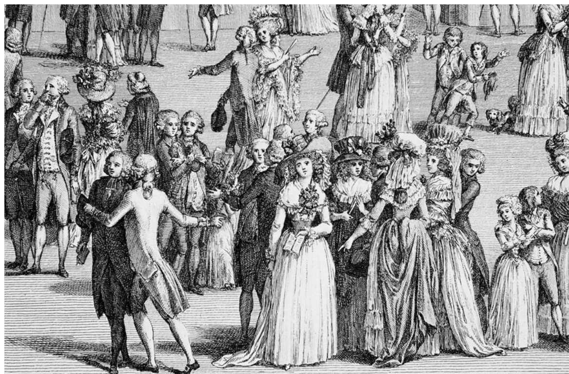
Figure 6. Pietro Antonio Martini, Exposition au Salon du Louvre en 1787 , detail.

Everything in the engraving, the diversity of the groups, their movement and gestures, the children, the dogs, the overall festive nature of the event, suggests that it is «une fête populaire». A celebration, nonetheless, with highly diverse participants with different interests and knowledge, which when put together, produced a clash «of opinions of a million individuals». The following is a description of just a few of the characters that mingled: