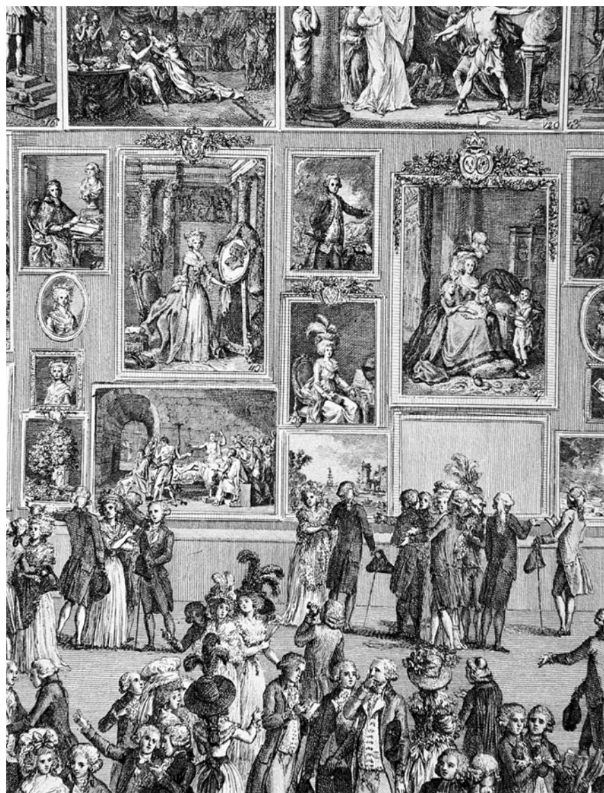
Figure 4. Pietro Antonio Martini, Exposition au Salon du Louvre en 1787 , detail

Although the analysis of the reviews and commentaries concerning the works on display in the Salon don't form the objective of this study, some of this written evidence supports Martini's meticulous visual testimony. From the image we can accurately deduce that historical