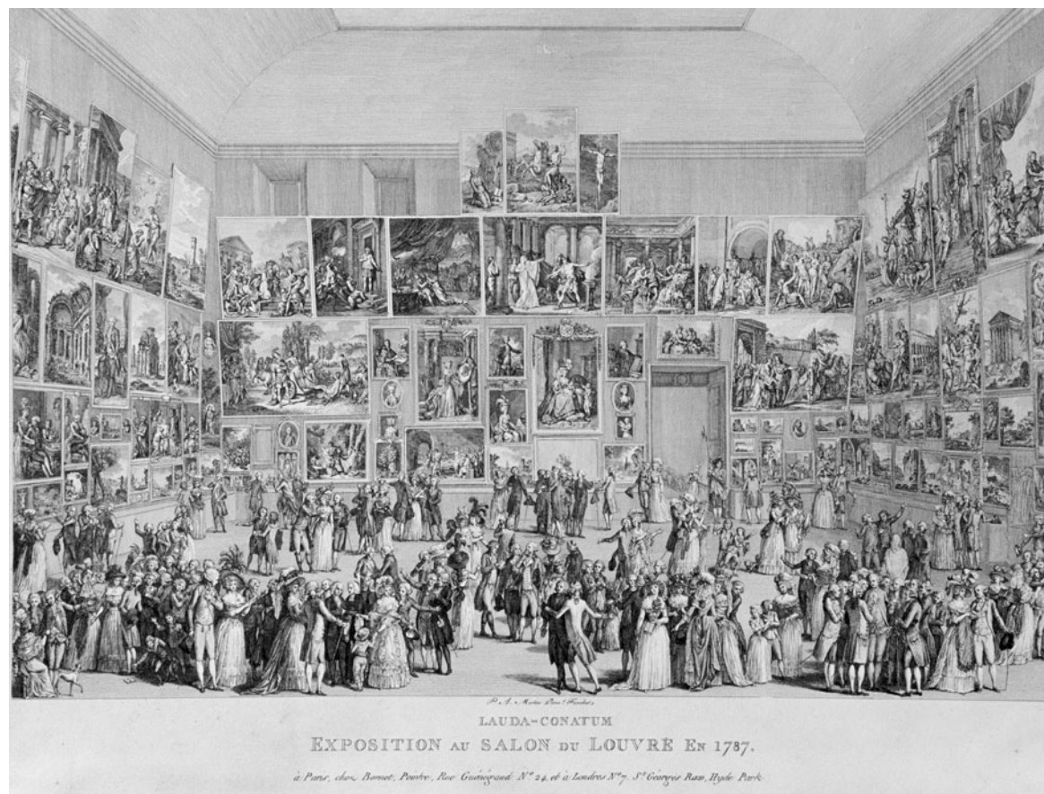
Figure 1. Pietro Antonio Martini, Exposition au Salon du Louvre en 1787 , engraving and etching, 390 x 530 mm. Private Collection, Barcelona