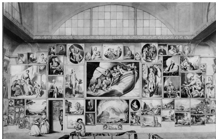
Figure 11. The Royal Academy Exhibition of 1784 (west wall of the Great Room), pen, grey ink and wash, with water-colour, 335 x 492 mm.

In spite of everything, the engraving does illustrate some of the traditional ways that experts and connoisseurs appreciated art. We have already seen how Reynolds, in the centre of the image, is pointing out and perhaps explaining to the Prince