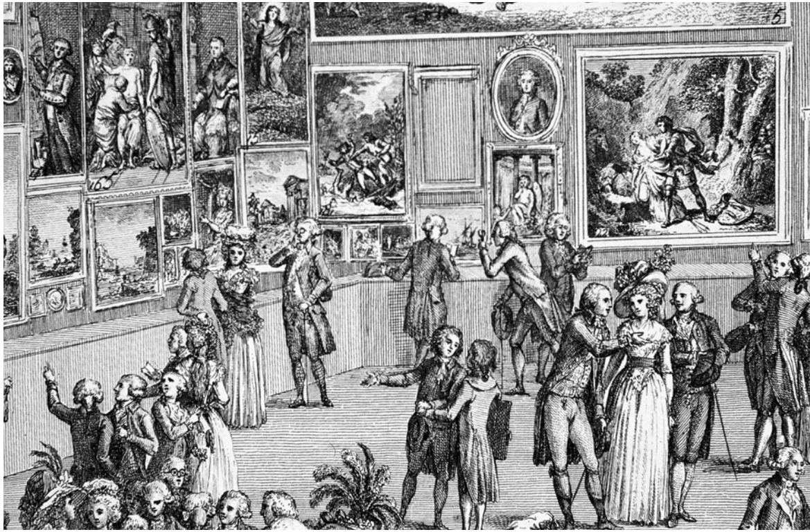
Figure 5. Pietro Antonio Martini, Exposition au Salon du Louvre en 1787 , detail.

28. Journal de Paris , September 26 p. 1164.