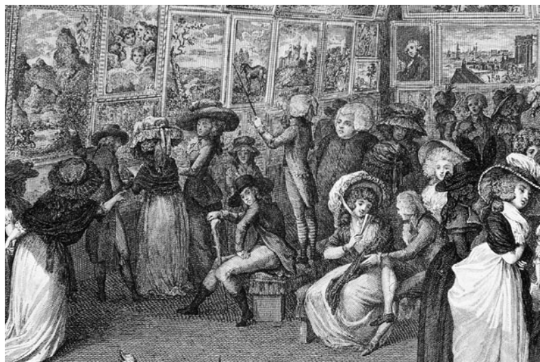
Figure 10. Pietro Antonio Martini after a drawing by Johann Heinrich Ramberg, The Exhibition of the Royal Academy, 1787 , detail.