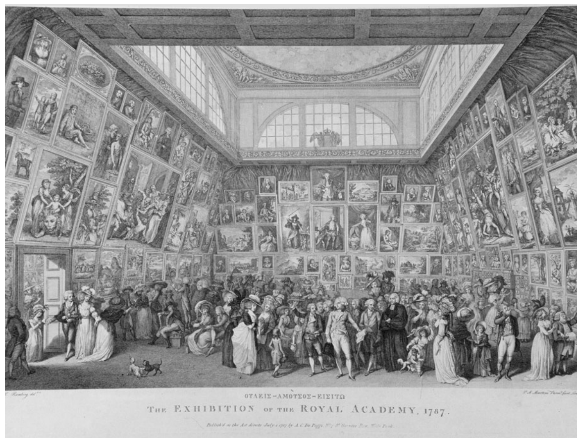
Figure 2. Pietro Antonio Martini after a drawing by Johann Heinrich Rambert, The Exhibition of the Royal Academy, 1787 , engraving and etching, 375 x 527 mm. Private Collection, Barcelona.