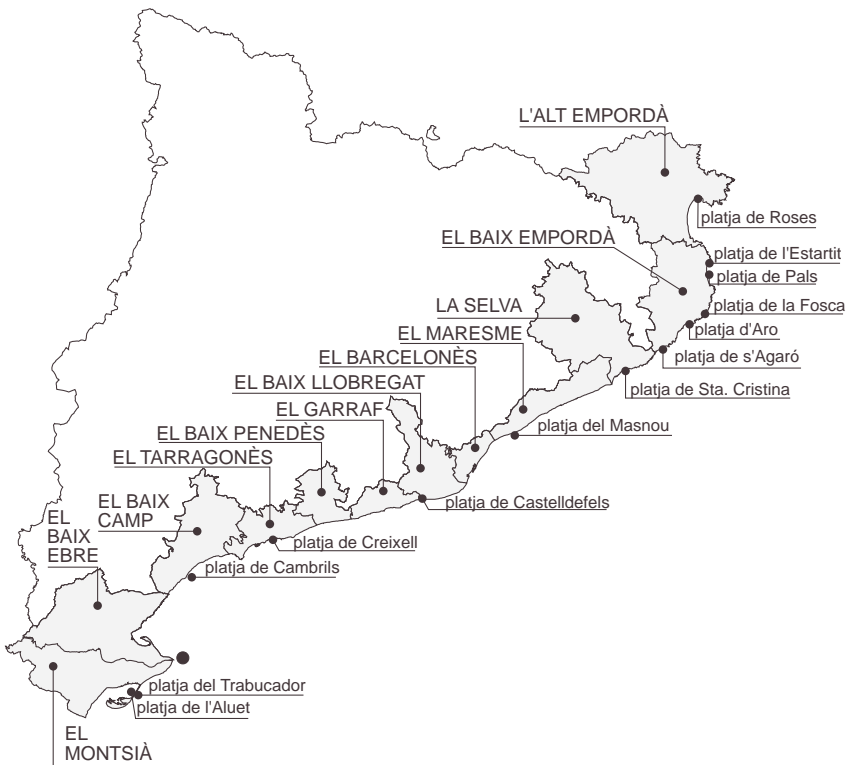
Figure 1. Location of the Catalan beaches sampled. Black circle: mouth of River Ebro.

During 1995, diurnal samples were taken once (during spring or summer) from 11 Catalan beaches (l'Estartit, Pals, la Fosca, Platja d'Aro, s'Agaró, Santa Cristina, el Masnou, Castelldefels, Cambrils, El Trabucador, L'Aluet), along a transect 100 m in length, parallel to the coastline, and at a depth of 1 m (Figure 1). A suprabenthic sledge with an aperture of 50 x 20 cm and 1 m long, with a 500 µm net, was used. This sledge was manually pushed with the aid of two rods fitted to the lower part of the frame. El Masnou beach was also sampled at 5 and 10 m, using another sledge with a 50 x 50 cm aperture and a net similar to that already descri-