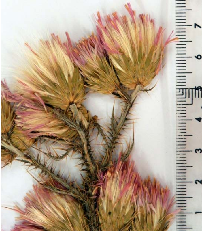
Figure 1. Carduus ibizensis (Devesa & Talavera) Rosselló & N. Torres: Detail of specimen UIB 16323.