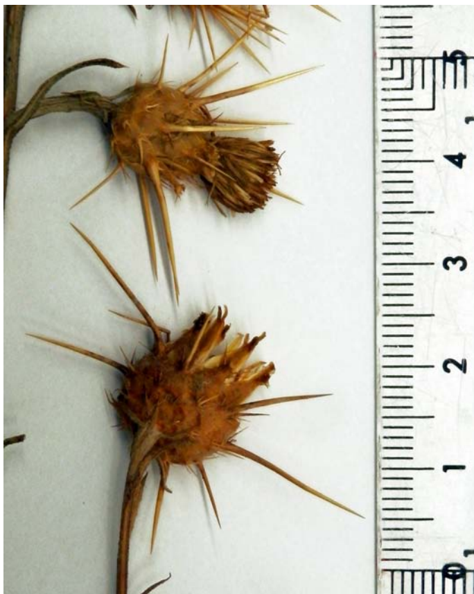
Figure 2. Centaurea solstitialis L.: Detail of specimen BCN 43603.

This species is not listed by Devesa & López (2013) for the Balearic archipelago. The dot in the map by Font & Vigo (2008) is based on this specimen without further comments. The voucher specimen is undoubtedly referable to C. solstitialis by its subglabrous or puberulent bracts, with the apical spine up to 16 mm long (Figure 2).