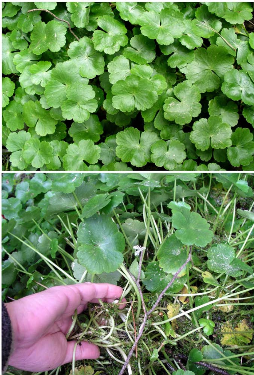
Figure 3. Hydrocotyle ranunculoides L. f.: Specimens from Banyalbufar.