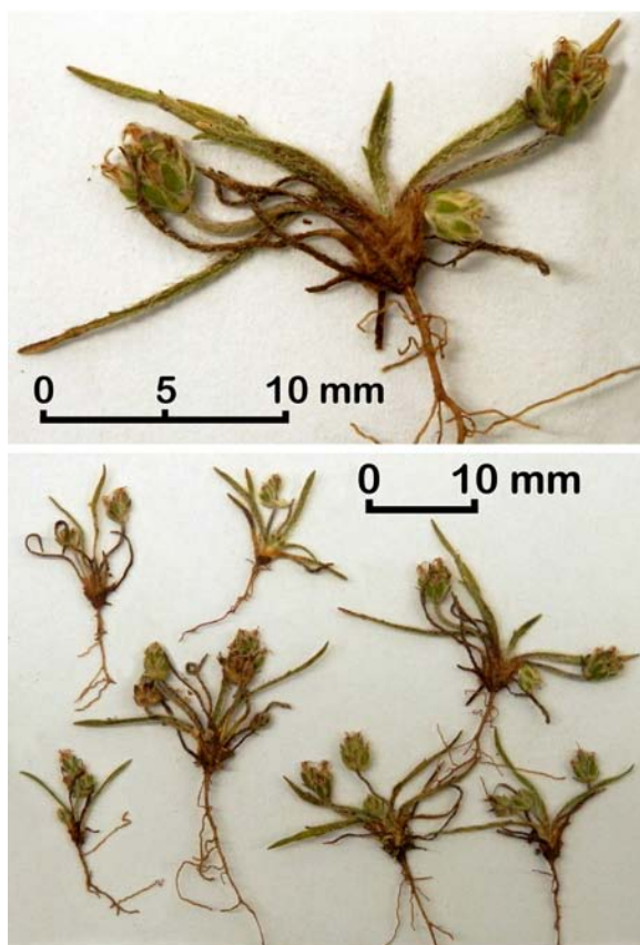
Figure 5. Plantago weldenii Rchb. subsp. weldenii : Details of specimens BCN 70415.

These extremely dwarf forms (figure 5) were found among therophyte and bryophyte communities. This taxon was previously known from Menorca (Fraga, 2008).