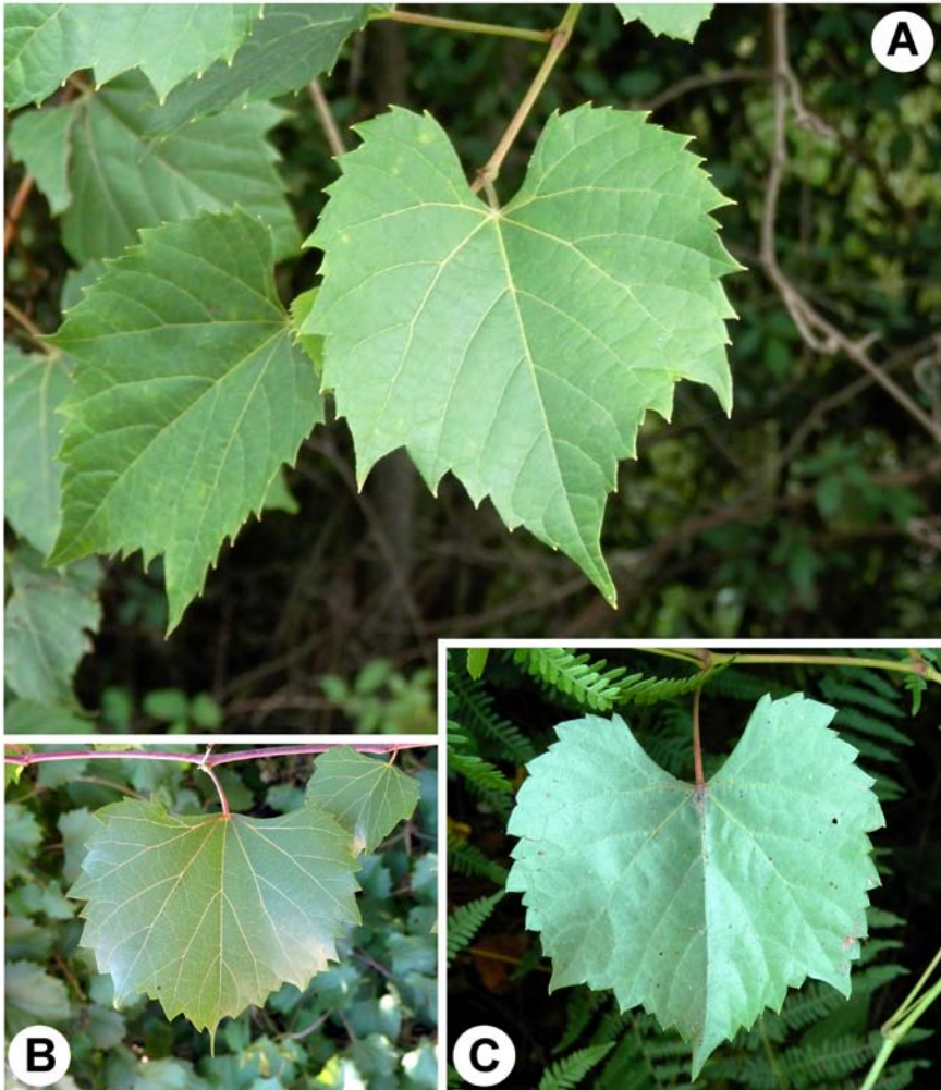
Figure 3. A: Vitis riparia Michx. (Sot de Can Amat, LS-7695); B: Vitis rupestris Scheele (Riera de Sant Llop); C: Vitis × instabilis Ardenghi, Galasso, Banfi & Lastrucci (Riera d'Arbúcies, LS-7670).

Riera d'Arbúcies, between Can Blanc and Can Pasqual, riparian vegetation, 31TDG6227, 210-220 m, 12-VII-2015, L. Sáez; Sot de Can Amat, Riells i Vimbrea, DG5924, 410 m, riparian vegetation, 26-IX-2015, P. Carnicero & L. Sáez LS-7695 (Herb. Pers.) (fig. 3A); riera d'Avencó 31TDG3824, 400 m, riparian vegetation, 10-X-2015, I. Granzow & L. Sáez LS-7700 (Herb. Pers.).