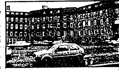
VICTORIA INFIRMARY, GLASGOW