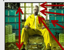
Height + weight Clothes + other items

The physical traits included in the character ADs were divided into 5 categories for the analysis: