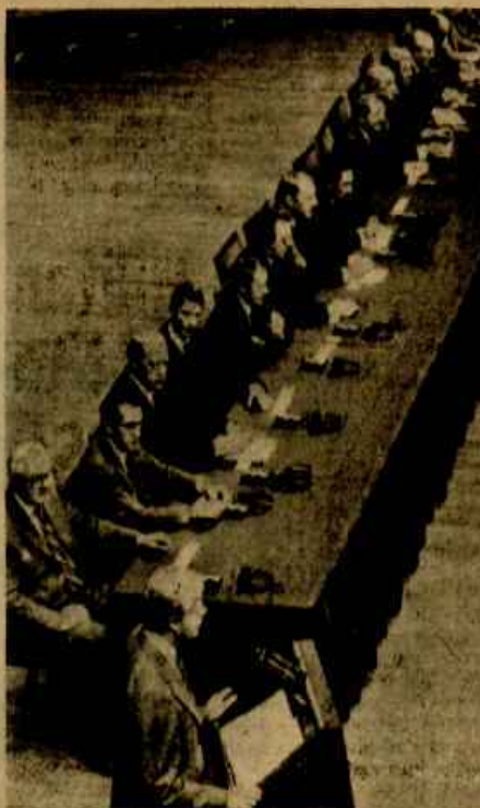
Carter speaks to NATO heads in Washington, D.C.

This is what the Trotskyist Organization and the Revolutionary Young Workers are fighting for in North and South America. This is what the Fourth International and the Revolutionary Youth International are fighting for around the world. October 10, 1978