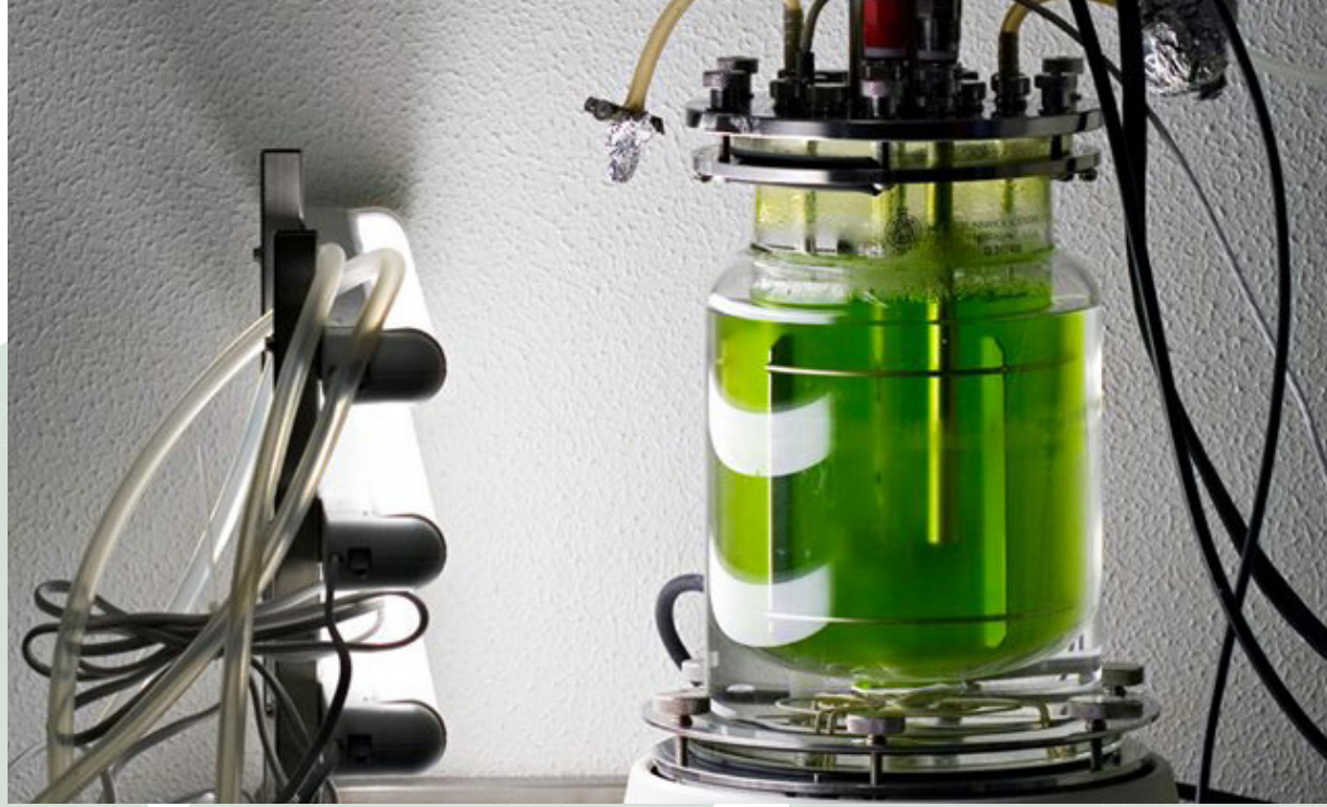
Figure 4. Cell suspension in a bioreactor