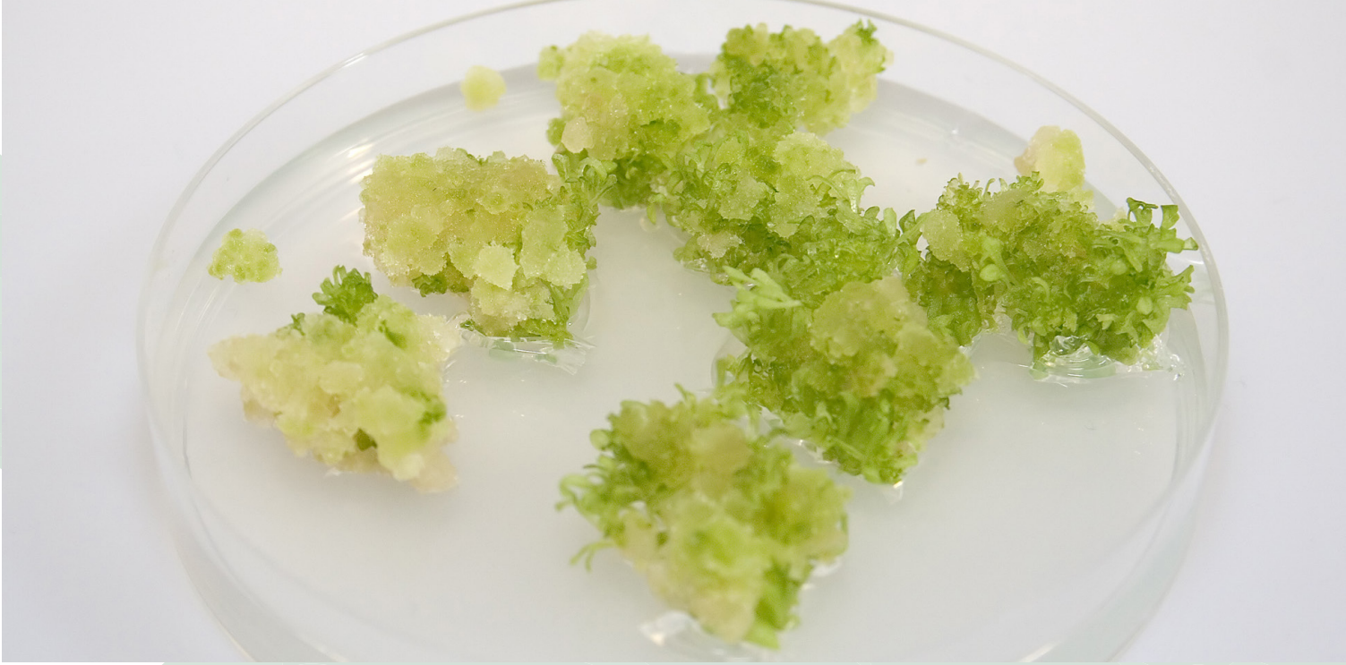
Figure 3. Callus induction of C. sativa