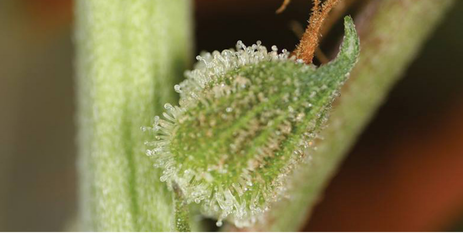
Figure 2. Female flower used as explant

The production of in vitro secondary metabolites can be possible through plant cell cultures. This technology represents a good model to overcome many problems linked to the conventional agriculture such as variations in the crop quality due to environmental factors: drought, flooding and other abiotic stresses and/or biotic stresses as diseases or pest attacks. Moreover crop adulteration, losses in storage and handling may decline the secondary metabolites production, which cannot be prevented by inability of some authorities.