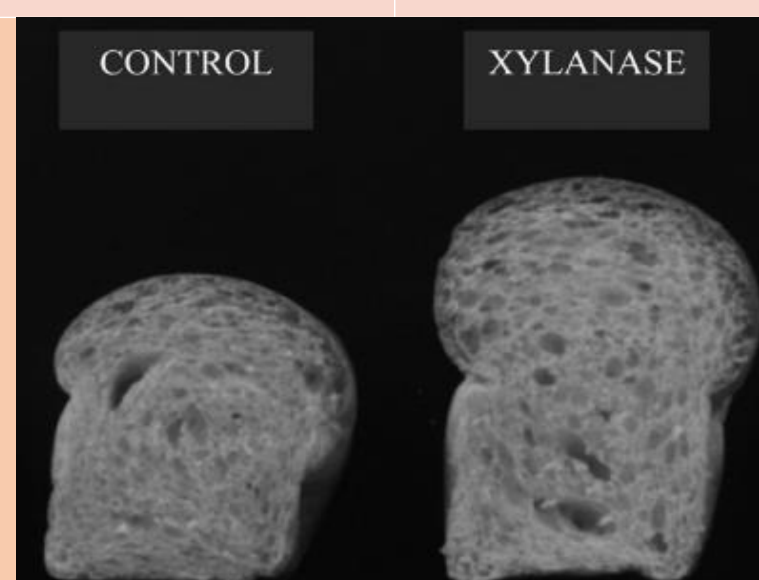
Figure 3: Effect of the PoXyn2 xylanase on whole wheat bread. (Driss et al. 2013)