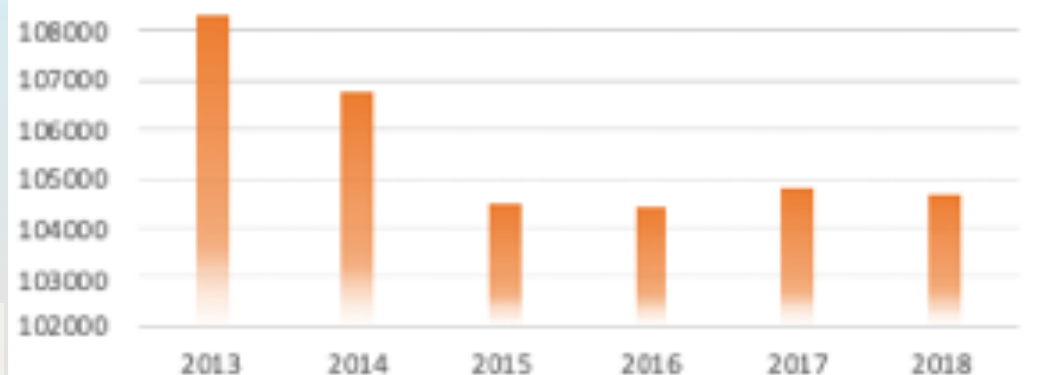
Figure 1: Spanish stray dogs, 2013 to 2018