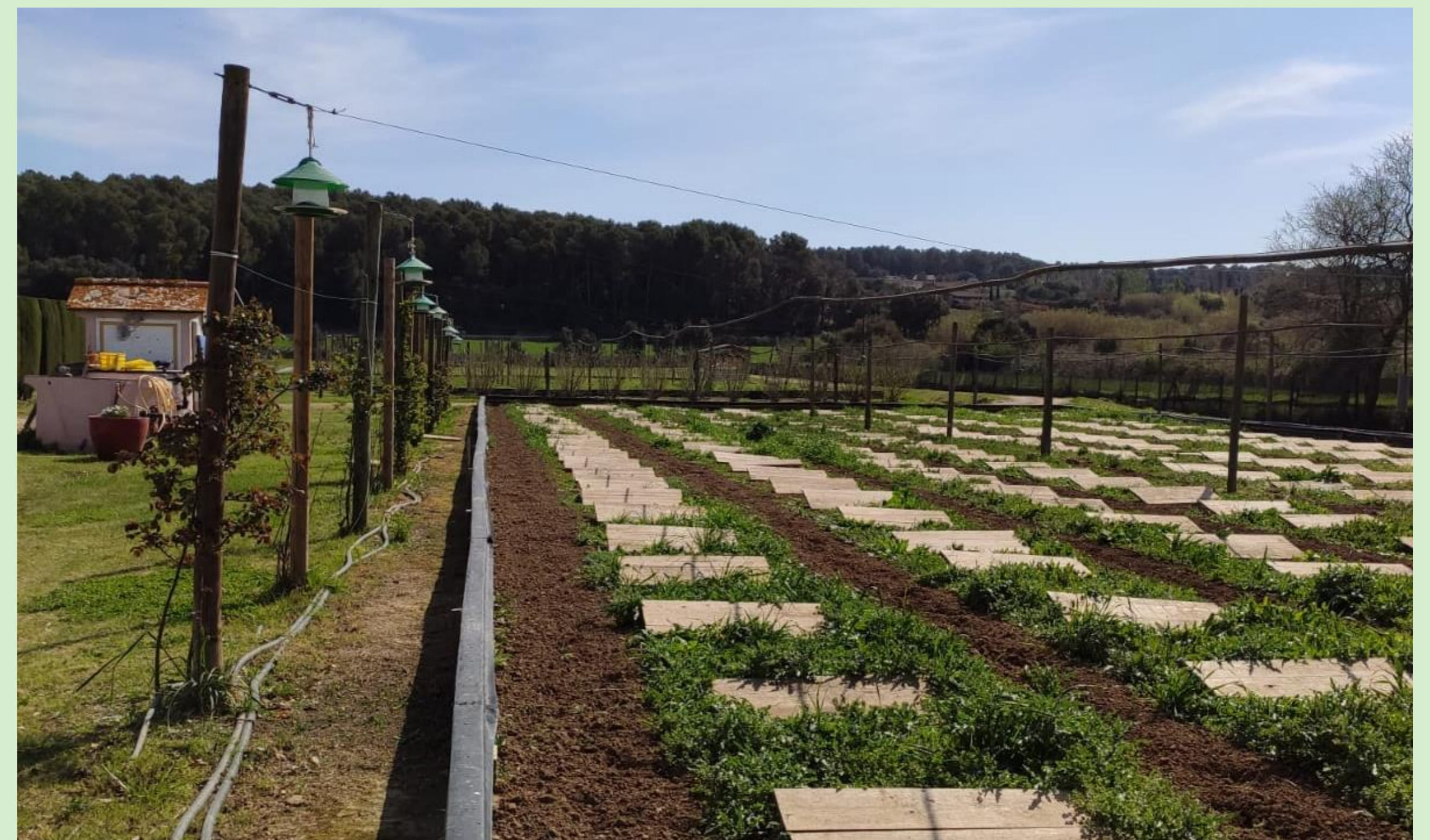
General view of the farm facilities

Pioneering organic snail farm in Catalonia. The only one with a CCPAE certificate.