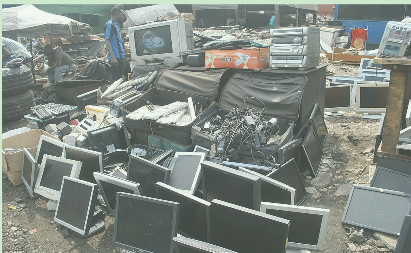
Picture 2. Broken televisions, computers and keyboards transported to Ghana