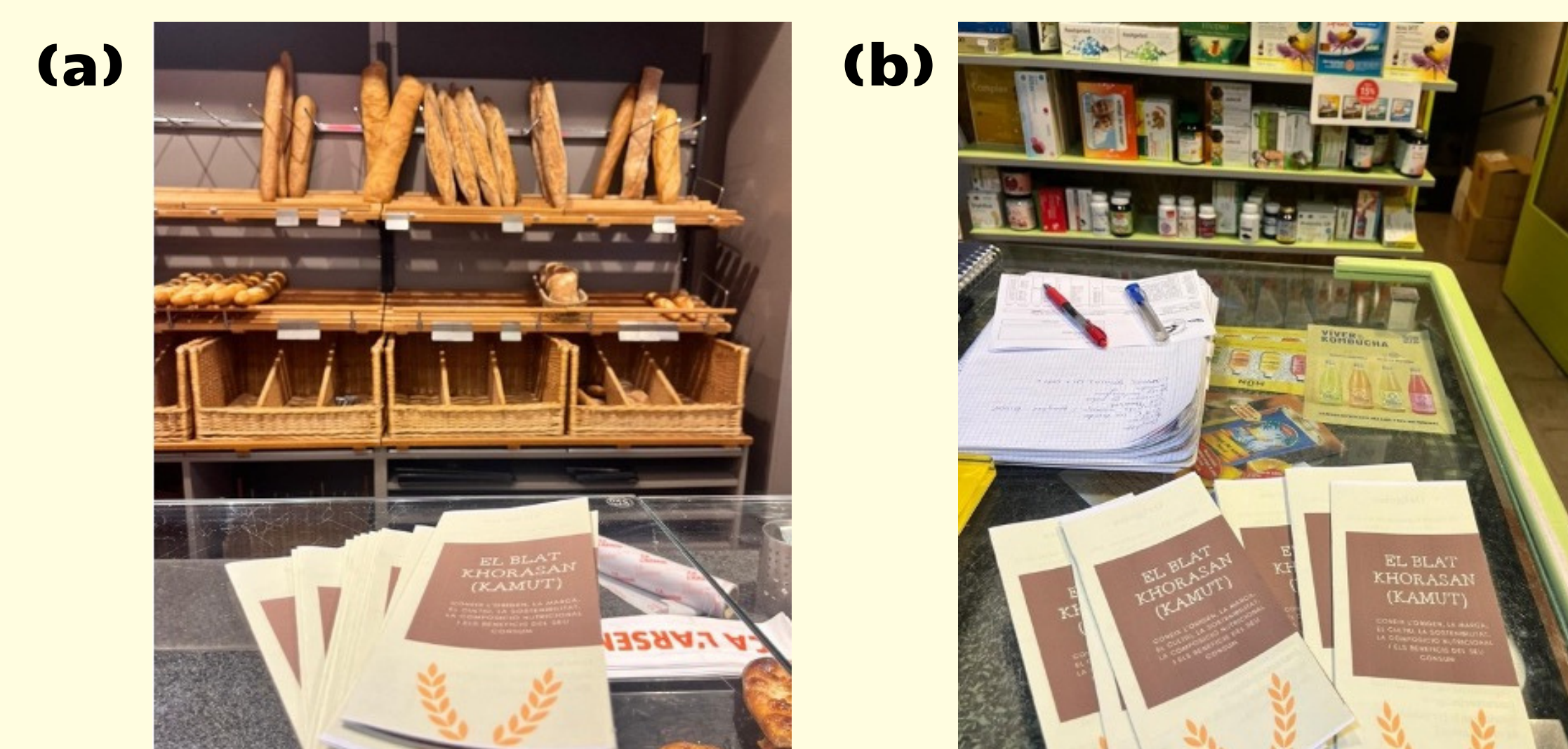
Fig. 2. Distribution of the flyer in two establishments in Sant Sadurn d'Anoia (Barcelona): (a) Ca l'Arseni, (b) Vida Sana