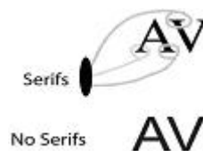
Figure 2 Differences between sans-serif and serif fonts.

- Use sans-serif fonts designed for screen reading, such as Verdana, Georgia, New York and Trebuchet. Usability studies have shown that these fonts improve screen reading (Nielsen 2000).