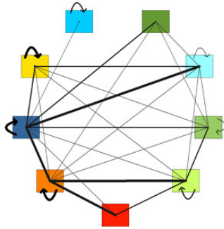
Figure 1: Residential mobility between socio-residential clusters in the RMB.

level, or district level in the case of the City of Barcelona, and by socio-residential clusters. The source for this analysis is the Statistics on Residential Variations and the Registration and Deregistration Records of Barcelona Town Hall. The residential flows are studied from three different points of view: place of origin, destination, and interaction coefficient between the two places. The combination of these three perspectives allows us to establish the migrant spaces. Once bounded and identified by the above criteria, these areas are analysed according to social diversity and residential features.