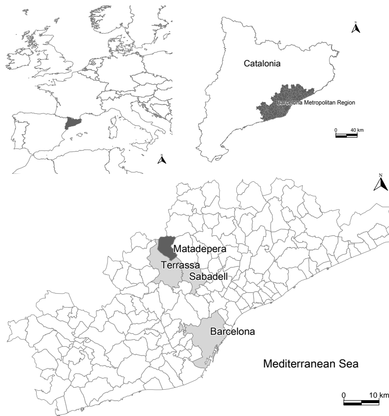
Figure 1. Location of Matadepera.

Spanish or European standards, three times higher than the average in central Barcelona.