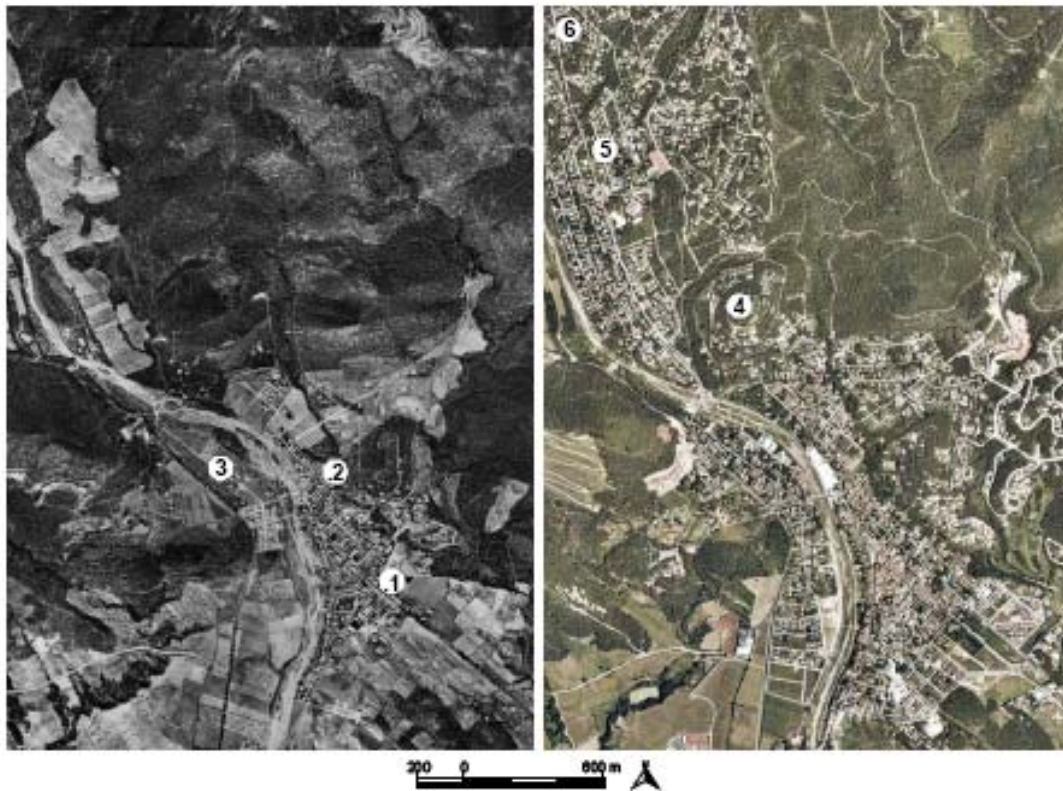
Figure 3. Aerial photographs of Matadepera. Left photo from 1956 shows the compact town centre and the incipient urbanization in the surrounding fields (US Army, 1956). Right photo taken in 2004 shows urban expansion to the north-west and east (Institut Cartogràfic de Catalunya, 2004). In this period, urban area increased from about 38 ha to about 358 ha. 1) St. Joan Street, former Camí Ral; 2) Arnau Street; 3) Development of one of the main stockholders of the Commission to connect Matadepera to Llobregat river; 4) Development of Prat; 5) Development of Barata; 6) Development of Serra.

Water price increases were politically contentious. Since the 1950s Aguas used a multi-tier tariff with lower rates for permanent residents and increasingly higher to holiday-makers and luxurious uses such as swimming pools and lawns. Price increases were thus relatively smaller for permanent residents, but still a grand portion of costs they were asked to pay related to the extension of supply and network to satisfy newcomers. In 1957 the town council approved a petition by Aguas for a 25% rise in the water bill 34 , but refused to do the same two years later, when Aguas asked again money for a new water tank and to buy more water from Mina “for the watering of gardens and the use of private pools, i.e. an increase in consumption due to the numerous recently built villas” 35 . In 1967 Aguas declared big losses and asked for a